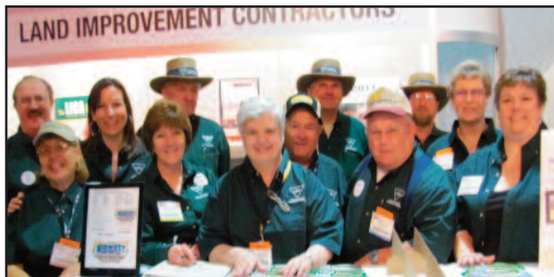
LICA's CONEXPO Booth 2011

LICA. This is a special introductory offer to new LICA members. Visit www.nerusa.com for more information.