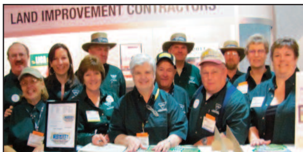
LICA's CONEXPO Booth 2011

LICA. This is a special introductory offer to new LICA members. Visit www.nerusa.com for more information.